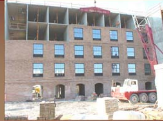
Wall Panel Erection