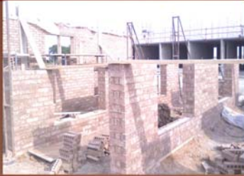
Wall Panels Prefabricated On-Site